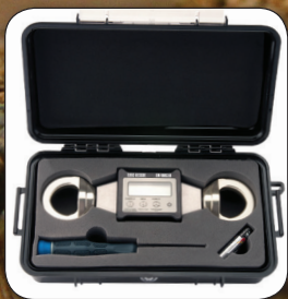
WATERPROOF CASE protects the Enforcer